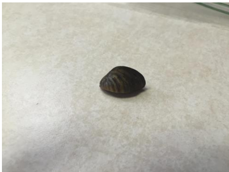
Photo 1. Zebra mussel found by a lake user swimming in Clearwater Lake, Wright County (86025200) on 5 July 2015. Photo was taken on 5 July 2015.

A shore-based investigation was conducted on 8 July 2015 to look for additional mussels; the search was conducted on foot and no zebra mussels were found. The search continued on 13 July 2015 with additional staff support utilizing both shoreline search methods and snorkeling. Zebra mussels were found attached to native mussels (Photo 2). Zebra mussels ranged from approximately 1.4 cm to 2.6 cm in length. A total of nine adult zebra mussels were found at two main locations approximately one mile apart (Figure 1).