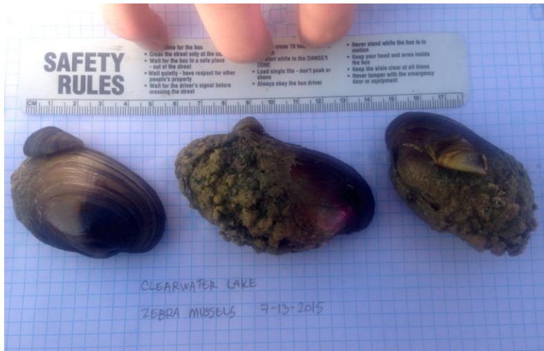
Photo 2. Zebra mussels attached to native mussels on Clearwater Lake, Wright County (86025200). Photo was taken on 13 July 2015.