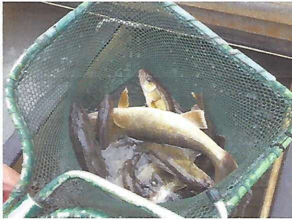
DNR Walleye Stocking 2018

Lake John Association P.O. Box 437 Annandale, MN. 55302